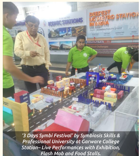
'3 Days Sybi Festival' by Symbiosis Skills & Professional University at Garware College Station – Live Performances with Exhibition, Flash Mob and Food Stalls.