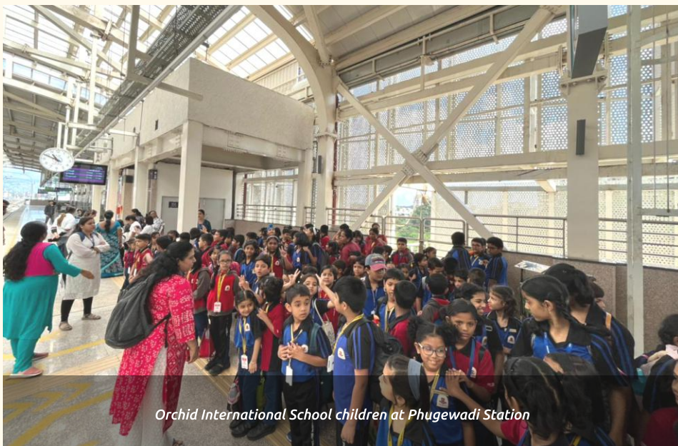
Orchid International School children at Phugewadi Station