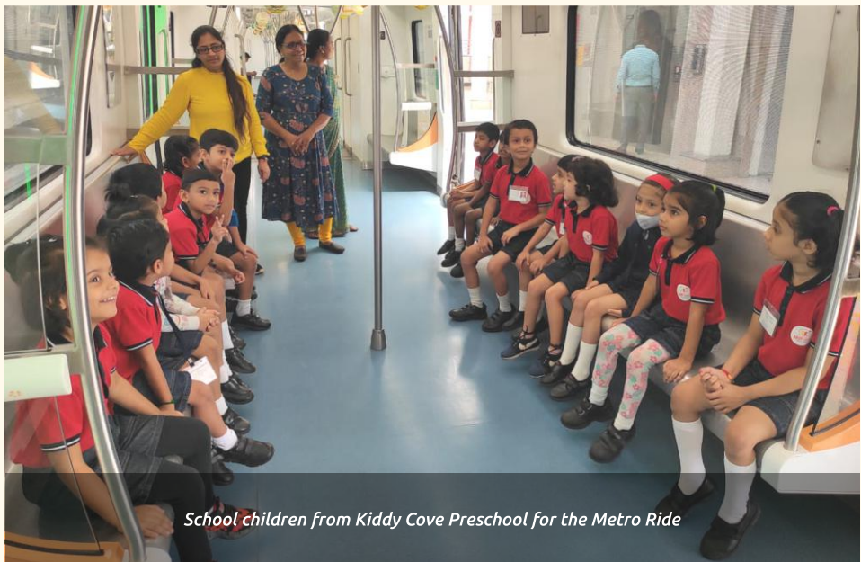
School children from Kiddy Cove Preschool for the Metro Ride