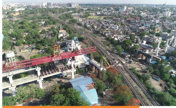
Actual progess of Multilayer Transport System