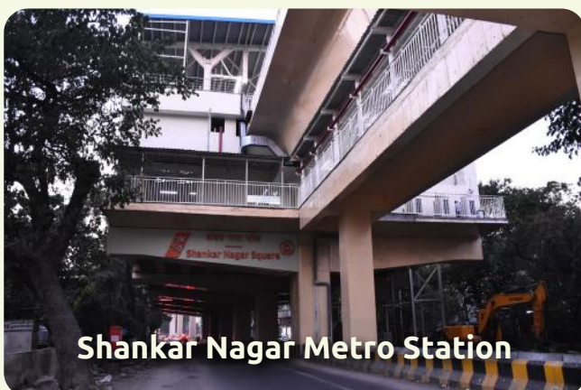
Shankar Nagar Metro Station

Entry and exit for these stations is facilitated from both the Northern and Southern sides. Both the stations are built on Aqua theme. Metro train services are now operational at these stations as per the scheduled timings between 8:00 am and 8:00 pm, wherein trains are available at an interval of 15 minutes.