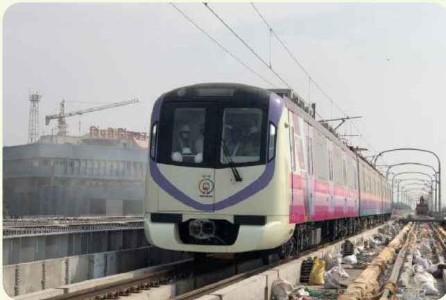
Trial Run Pimpri-Chinchwad