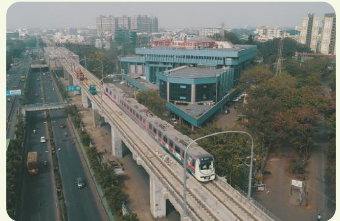
Arial View: Trial Run Pimpri-Chinchwad

The New Year started with a bang for Pune Metro project. On January 3rd of 2021, the project successfully carried out the trial run of train operations along the 6 km priority section from PCMC station to Phugewadi station of North-South Corridor.