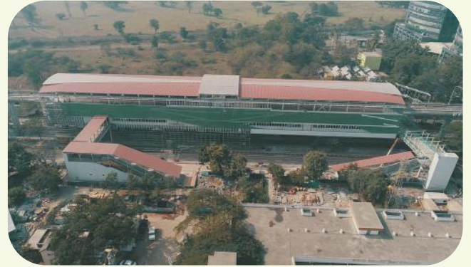
Sant Tukaram Metro Station

Once the passengers reach the concourse level, they are welcome by paid and the unpaid areas. At Mumbai side of the unpaid area exist technical rooms for day-to-day operation of Metro like Signaling Equipment Room (SER), Technical Equipment Room (TER) and UPS (S&T), Station Control Room (SCR), Ticket Office Machine room (TOM),