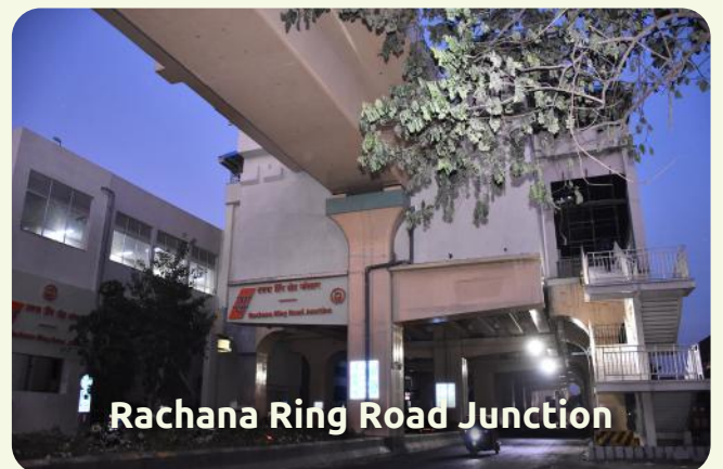
Rachana Ring Road Junction