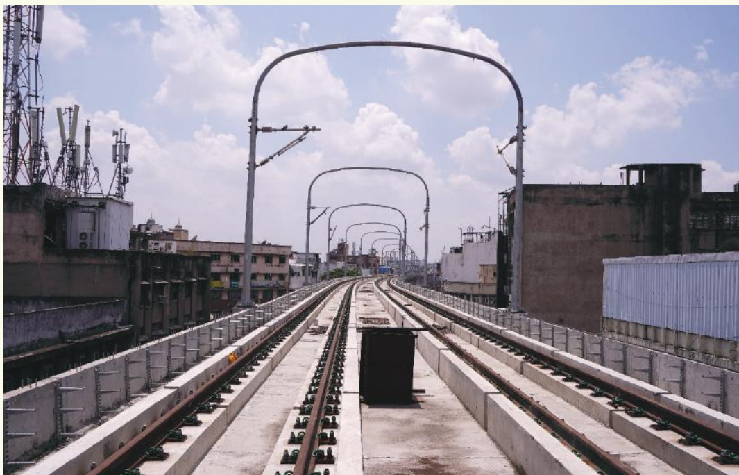
TRACK LAYING AT NAGPUR