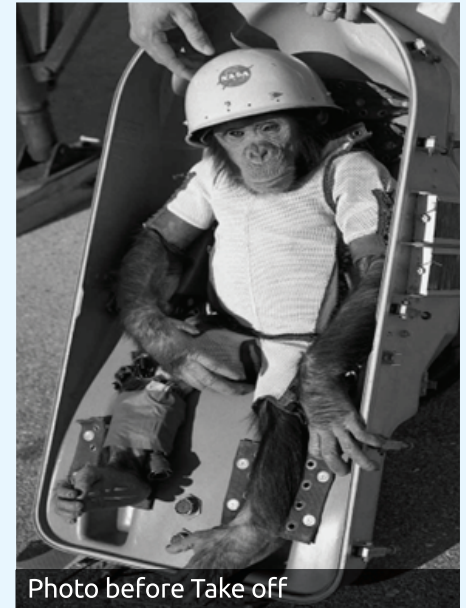
Photo before Take off

On January 31, 1961, the chimp dressed in a mini spacesuit, was launched aboard a Mercury-Redstone rocket. During his sub-orbital flight, computers on the ground measured normal vital signs, letting mission control know the brave chimp was alive. During the mission, the Mercury capsule lost pressure, but Ham was saved by his spacesuit.