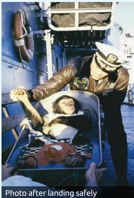
Photo after landing safely

He performed his tasks admirably and his capsule touched down safely in the Atlantic at the end of the 16-minute flight. Though he pulled his lever just slightly slower in space than he did on Earth, this feat proved that human motor control was possible in space only when he had safely returned to Earth with nothing worse than a bruised nose.